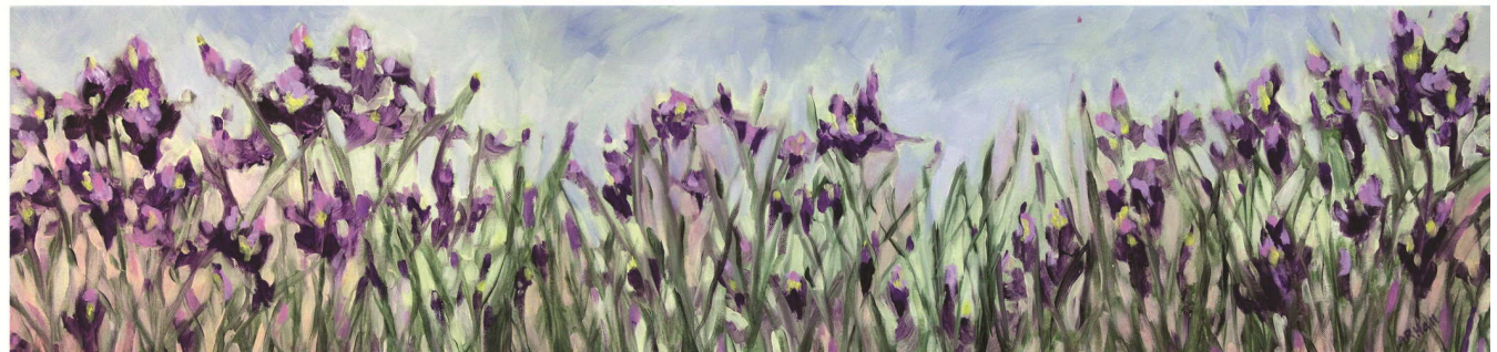
L to R, top: Circle in the Square (acrylic, 36"x36"), An Overwhelming Sense of Red Is Making Me See Spots (acrylic, 60"x60"), The Red Sea (acrylic, 60"x60"). L: Fulsome Iris (acrylic, 24"x18"). Center, L to R (all are acrylic, 6"x6"): Launch to the Moon , Along the Dotted Line , Orange-tipped Bouquet , Flying High , Bouquet in Striped Vase , Deep Purple . Bottom: A Tribe of Iris (acrylic, 12"x48")

subject matter, such as in The Red Sea (above center), she uses reference material. Annette works primarily in acrylic, but also paints in oil, watercolor, pastel, and mixed media. She accepts commissions from those who want a specific color scheme or subject matter that isn't available in an existing piece (call for procedure and pricing, 704-798-9400).